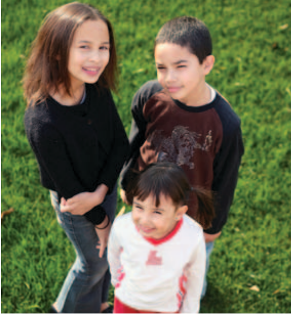
Canada has an official multiculturalism policy and a Multiculturalism Act to implement it.